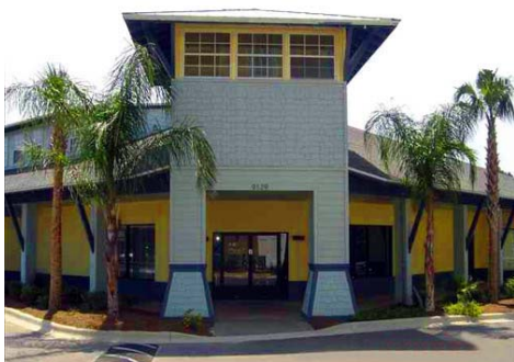
Photo of the Palms Conference Center at the Sleep Inn Hotel

Social and economic struggles are overwhelming to survivors and their families. Community integration and reestablishment issues seem insurmountable. Second Chance of Northwest Florida exists to help restore function, hope, dignity, and quality of life. (Source: secondchancenwfl.com )